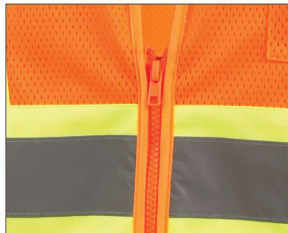
Zipper Closure for a more secure fit