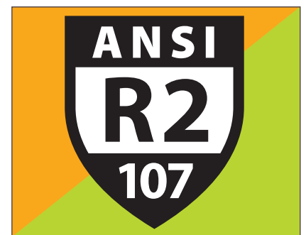
ANSI/ISEA 107-2015 Type R, Class 2 high visibility protection