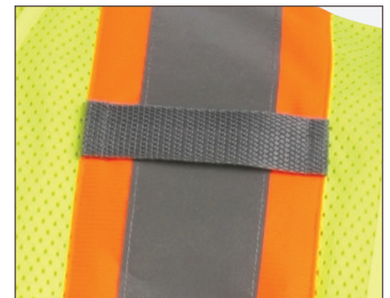
Mic Tab allows for quick & easy access to hand microphone